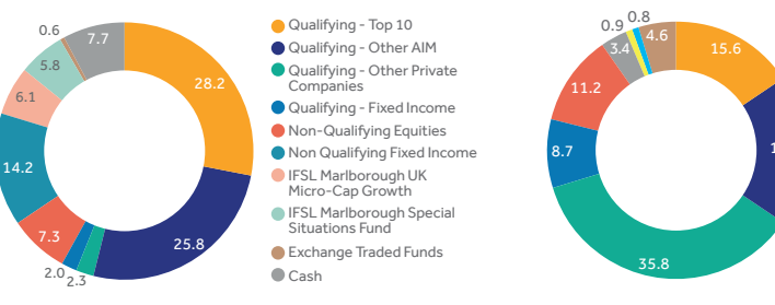
Qualifying sector allocation (%)