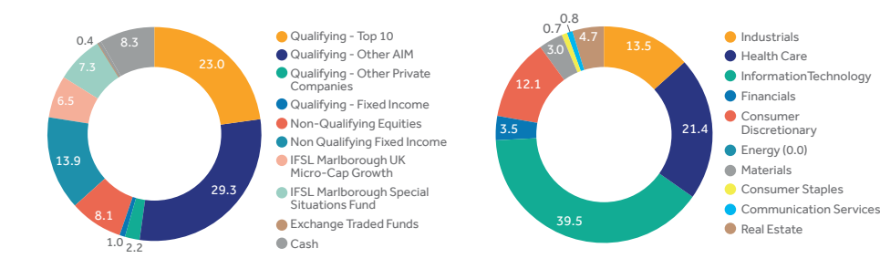
Qualifying sector allocation (%)