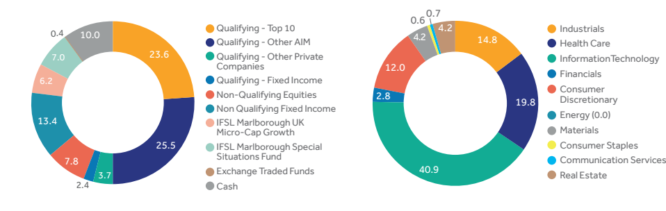
Qualifying sector allocation (%)