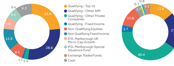
Qualifying sector allocation (%)